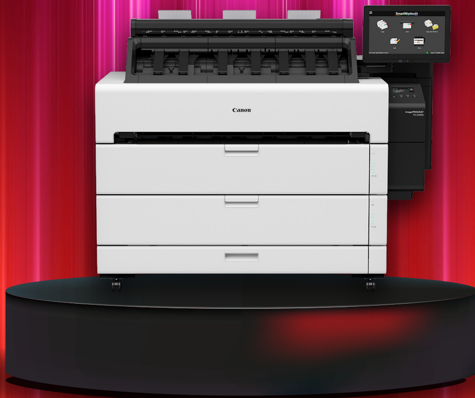
imagePROGRAF TZ-32000 MFP Z36